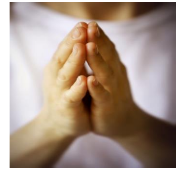
Keep it before the Lord in prayer